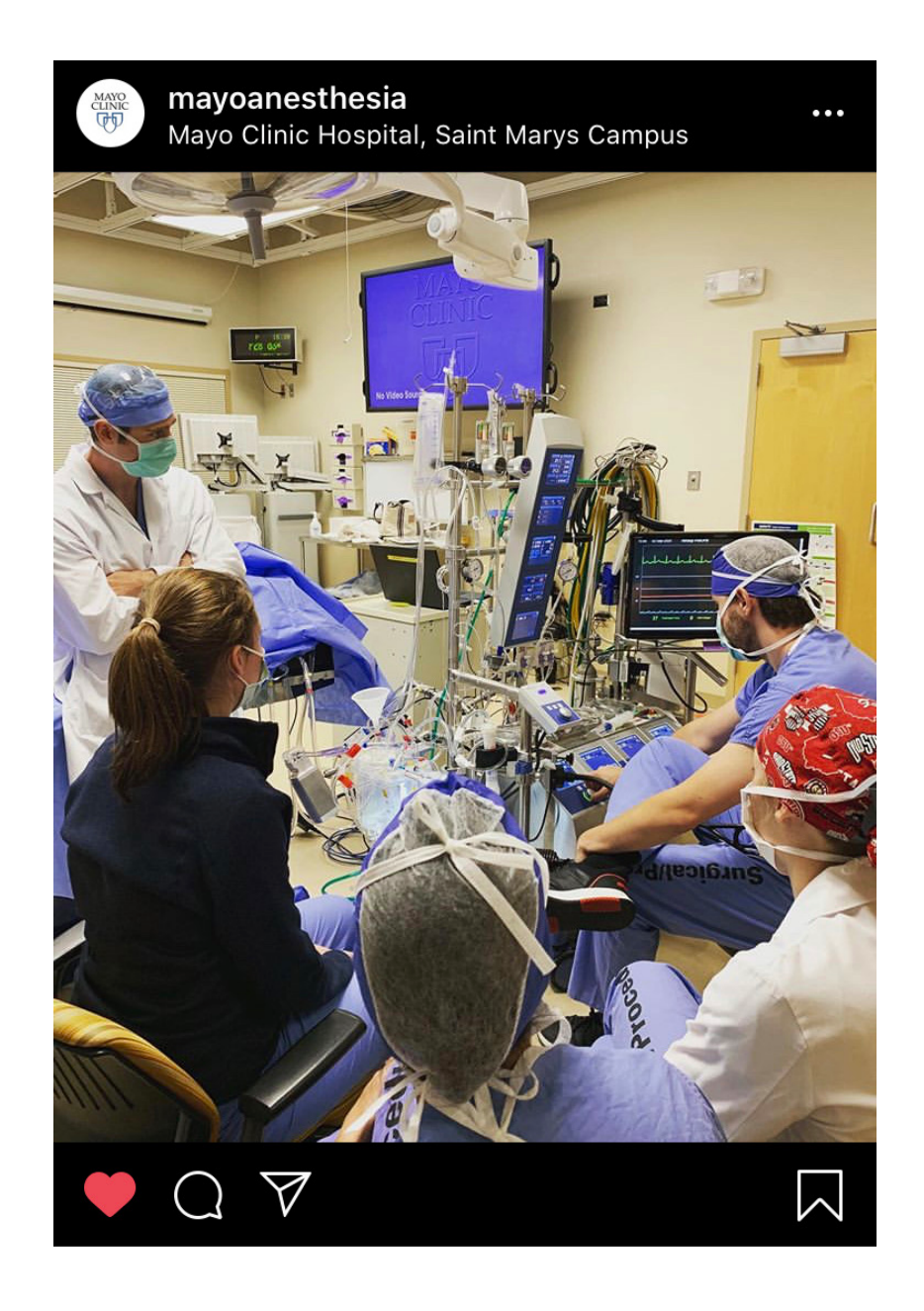
Figure 3. A screenshot from the @mayoanesthesia Instagram account depicting a group of residents learning about the perfusionist's role in cardiopulmonary bypass in the simulation center.