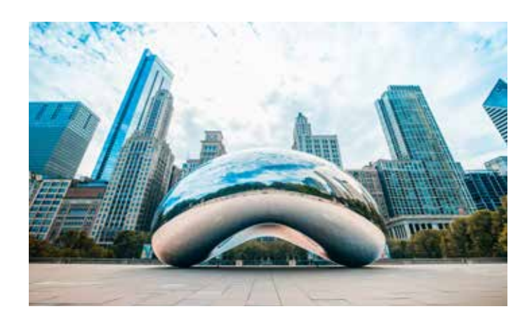
2022 Fall Meeting November 9-11, 2022 Swissotel Chicago Chicago, IL