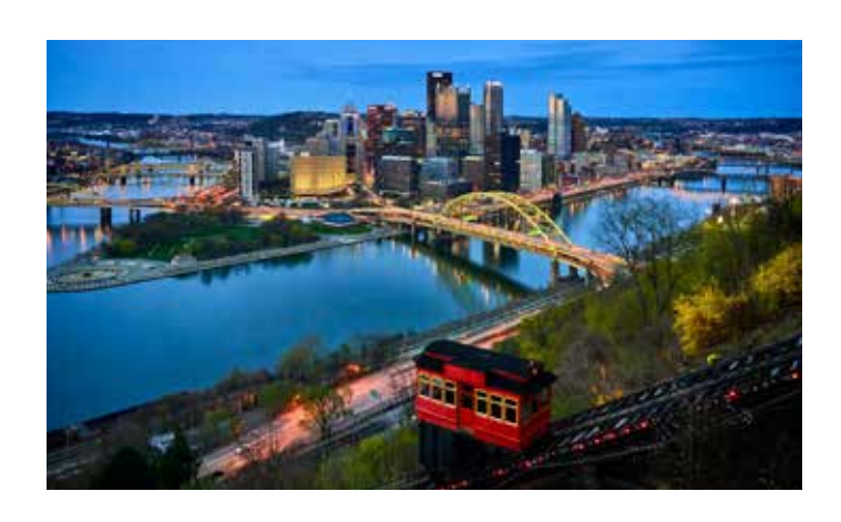
2022 Spring Meeting April 8-10, 2022 The Westin Pittsburgh Pittsburgh, PA