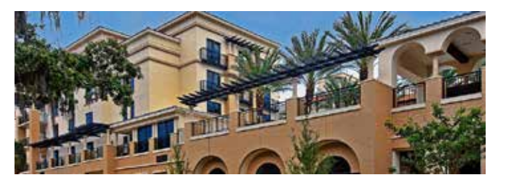
2021 Workshop on Teaching January 30 – February 2, 2021 The Alfond Inn • Winter Park, FL