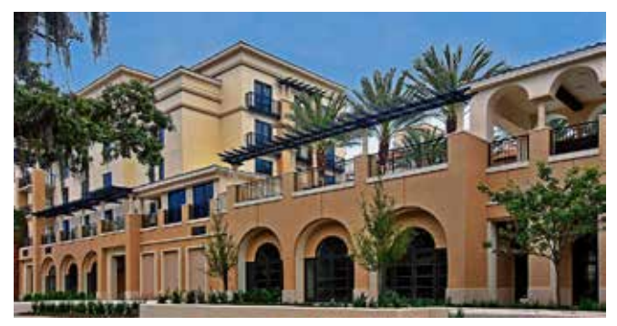
2019 Workshop on Teaching January 25-29, 2019 The Alfond Inn Winter Park, FL