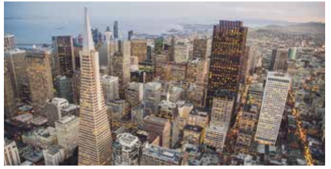
2018 Fall Annual Meeting October 12, 2018 Hilton San Francisco Union Square San Francisco, CA