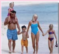
Enjoy walks along the beach with your family

Swim and take in the warm Florida sunshine