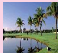
Play a round of golf at a nearby golf course

Enjoy a variety of water sports such as jet skiing and banana boat rides