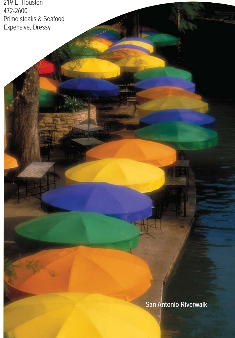
San Antonio Riverwalk

(0.1 mile from hotel) 111 W. Crockett St. 229-1941 Beef & pork ribs, poultry, extra lean brisket. Fun roadhouse atmosphere. Casual attire, moderate. Lunch, dinner.