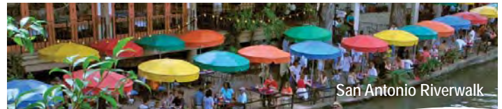
San Antonio Riverwalk

Visit http://saairportshuttle.hudsonltd.net/res?USERIDENTRY=HYATTRW&LOGON=GO for online reservations or visit http://saairportshuttle.hudsonltd.net/res?USERIDENTRY=HYATTRW&LOGON=GO